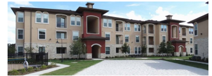
Highland Villas Apartments

Contact: (979) 822-3826—14 units with 1 for persons with a disability