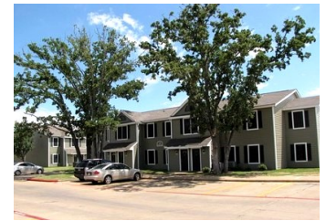
Saddlewood Club Apartments