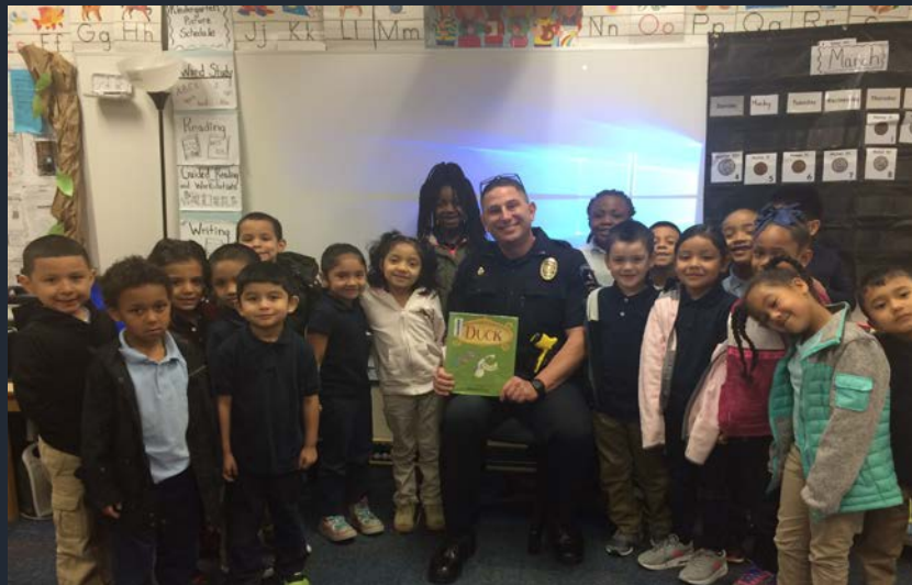
Four APD officers participated in this year's "Reading Rocks" Day at Crouch Elementary School. Officers read their favorite children's books to the students.